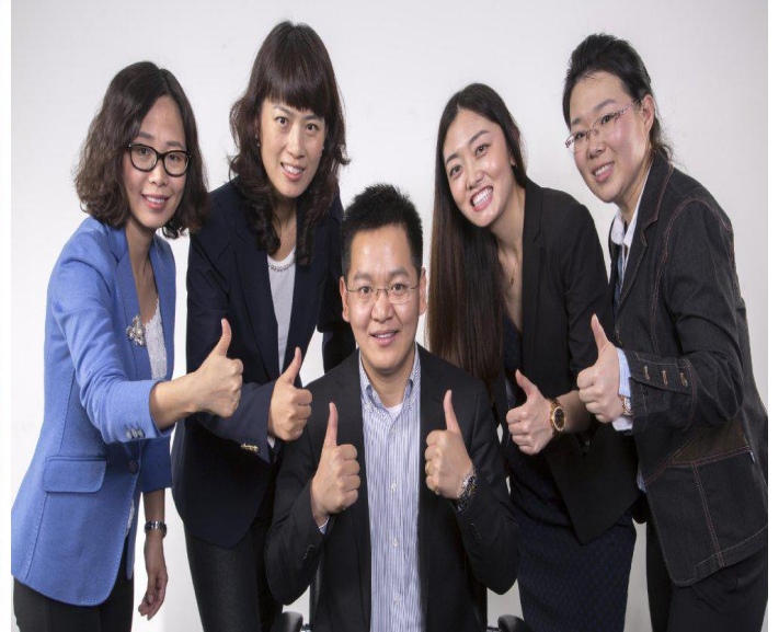
Hometech Shenzhen Sales Team