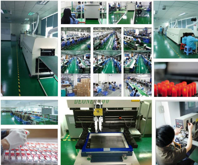
All department of our factory