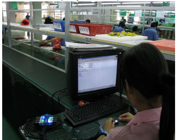
The quality control inspection 2