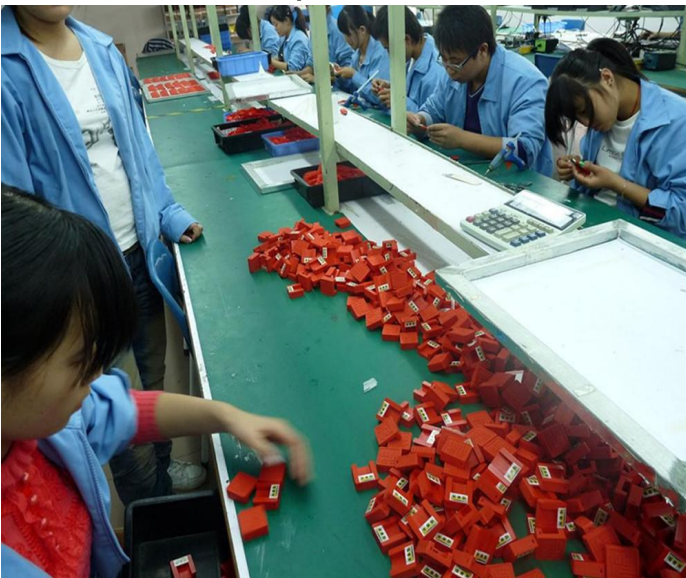
The production line 3