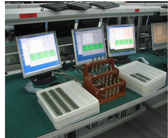
The quality control inspection 1