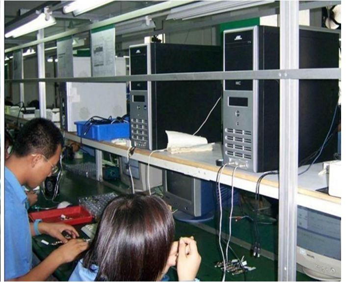
The production line 2