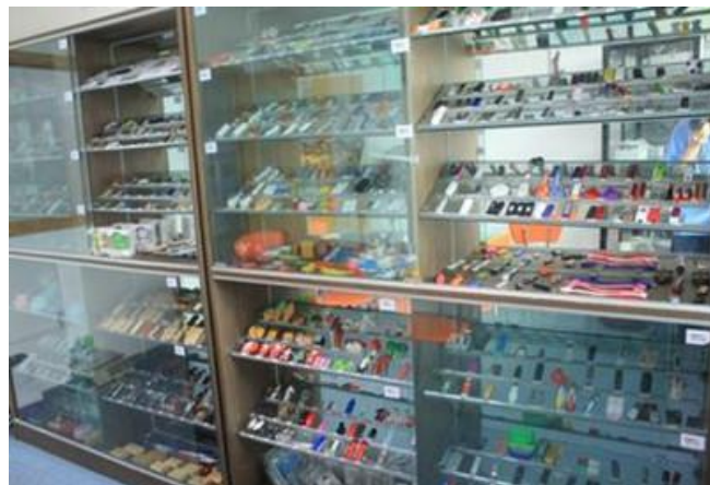
The show room