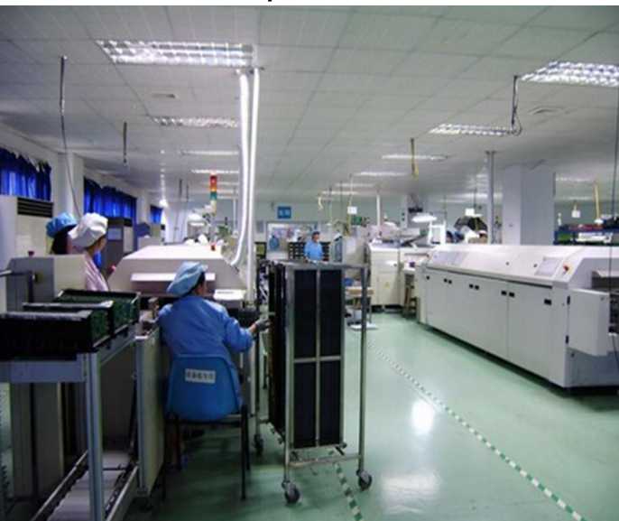
The production line 4