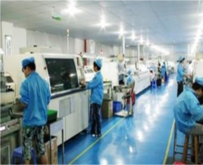
The production line 1